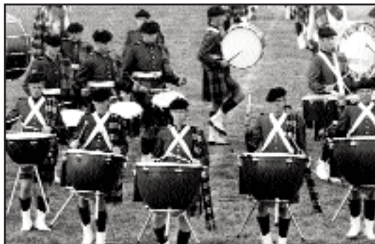
Kilties, 1970 (photo by Paul Stott from the collection of Drum Corps World).