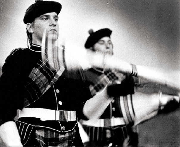
Kilties, 1975.

now in yellow and black McLeod plaid kilts and tartans and wore their old blue and red jackets which had been dyed black.