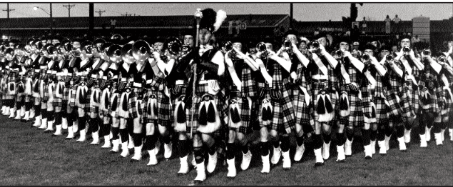
Kilties, 1976 (photo from the collection of Drum Corps World).

At the Big V Invitational in Milwaukee, the Racine corps came in fourth. At the