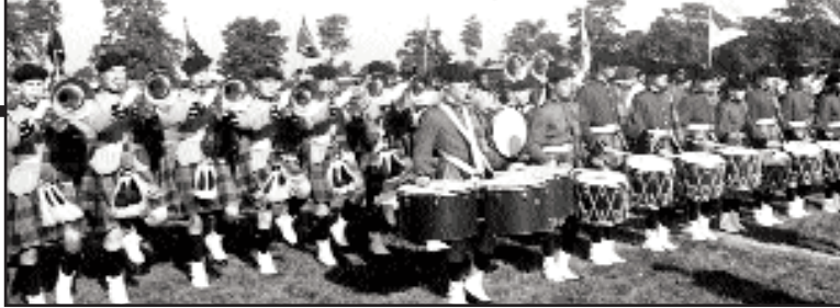
The Kilties at the 1968 VFW Nationals.

Nationally, the Kilties went out East and finished in eighth place at the 1954 American Legion National Championship in Washington, D.C. The color guard also won the 1954 Legion junior color guard championship.