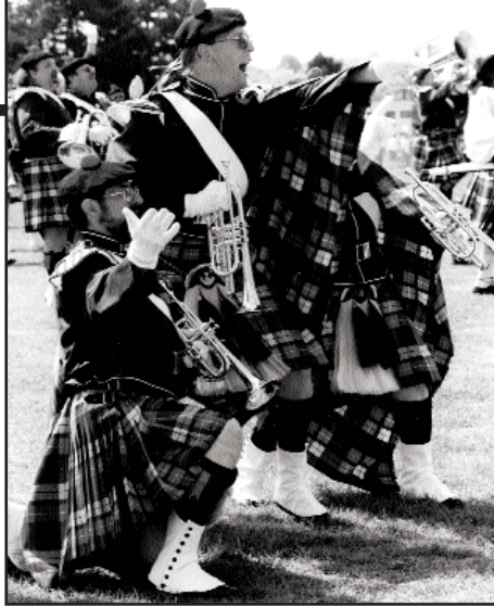
The Kilties senior corps at 1998 DCA prelims.