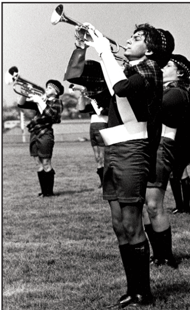
Kiltie Kadets, 1977.

Championship in Racine in 1980, the Kiltie Kadets took first place.