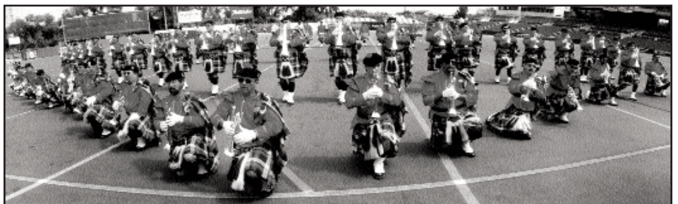
Kilties, 2001 at DCA prelims in Syracuse, NY.

For a photo and bio on George Fennell, turn to page 197.