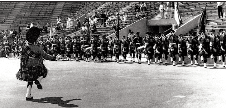
(Top to bottom) The YMCA Kilties in 1936; the 1942 corps; 1948; the Kiltie Kadets in 1966; at the 1964 VFW National prelims in Cleveland, OH.