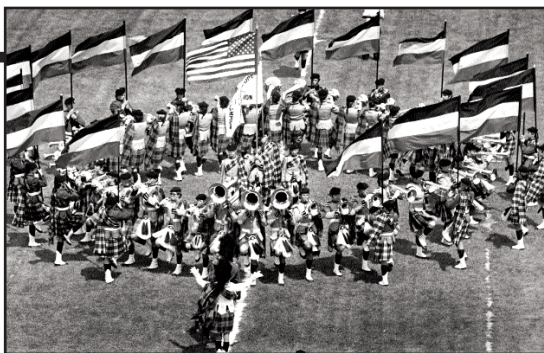
The Kilties, 1972.