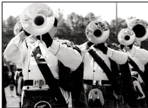
Kilties Senior, 1997.

in Racine County Circuit Court claiming the Kilties were delinquent on two loans totaling $17,239.25. The suit was seeking the amount of the loans plus immediate possession of the inventory of uniforms and instruments, and three vehicles.