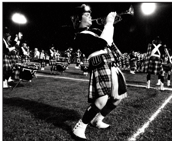
Kilties, 1974 (photo from the collection of Drum Corps World).

The 1974 season was yet another year that saw the Kilties field a very competitive and entertaining corps. They hit the field with new uniforms in 1974. The whole corps was