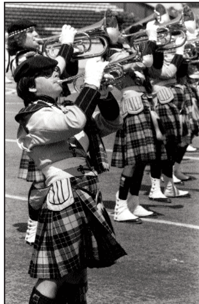
Kilties, 1978.

18-day DCI western tour with many changes and their scores began to climb. At the 1978 DCI Championships in Denver, CO, the corps placed 12th in both prelims and finals.