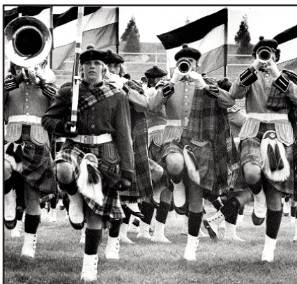
Kilties, 1973 DCI in Whitewater.